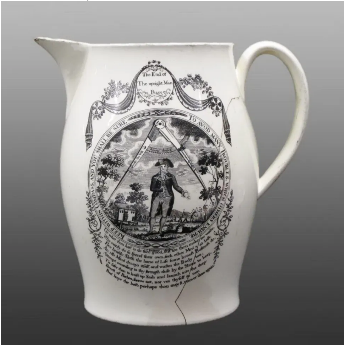
The collection of the Potteries Museum & Art Gallery, Stoke-on-Trent