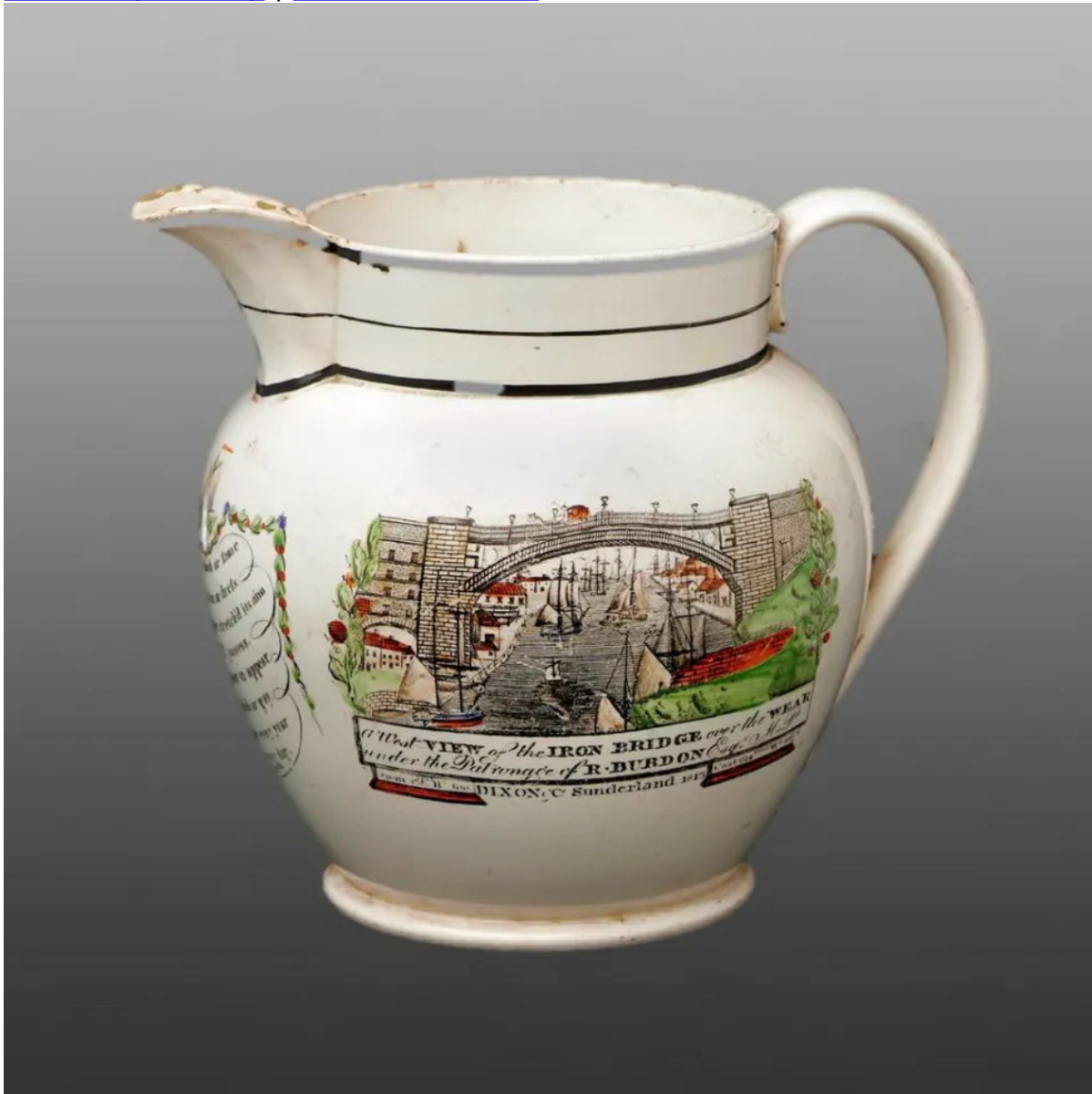
National Maritime Museum, Greenwich, London, Walter Collection